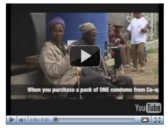
(Video filmed by our The Co-operative, our leading retail partner in the UK)

ONE® is proud to be a socially conscious condom brand. We know that our consumers are socially conscious, too. That's why we're proud to partner with you and The ONE Foundation to fight this epidemic.